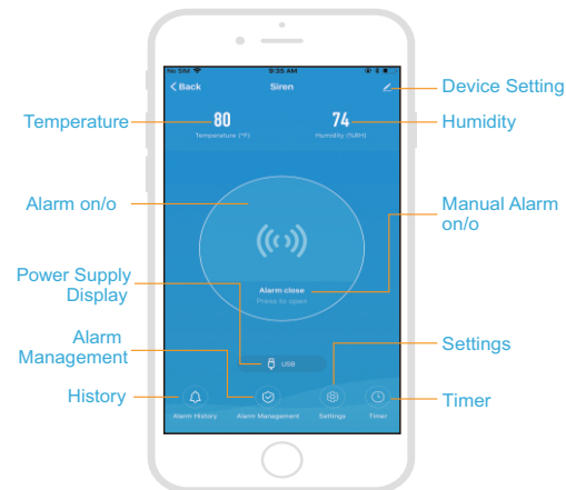
Sensinova App-User Interface